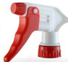
LI 107-E Ø28/400, Ø28/410, Ø28/415