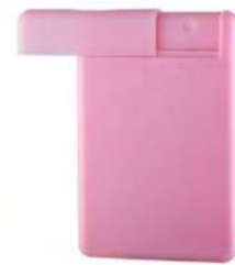
LI 610-3 20ml