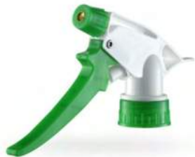
LI 107-A2 Ø28/400, Ø28/410