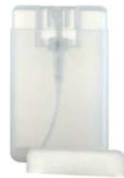
LI 610-2 20ml