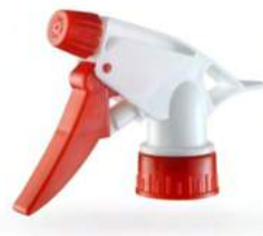
LI 107-A Ø28/400, Ø28/410