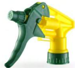
LI 107-D Ø28/400, Ø28/410