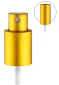
LI 601-3 Ø18/415 Full Alu.