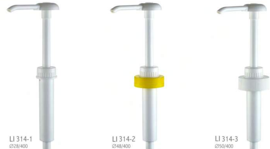
LI 314-1 Ø28/400

Discharge Rate: 30.00ml/T Specification: Ø28/400, Ø48/400, Ø50/400