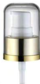
LI 604-4 FULL AS CAP