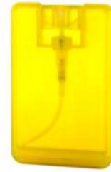
LI 610-1 20ml