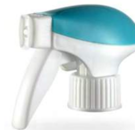
LI 105-3 oil