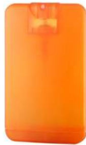
LI 610-1 45ml