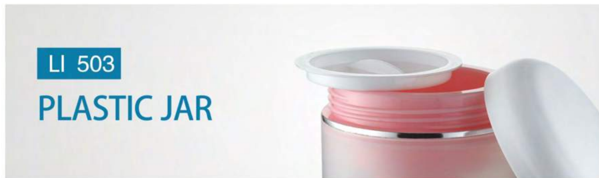
LI 503 PLASTIC JAR