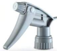
LI 107-B Ø28/400, Ø28/410