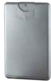
LI 610-1 28ml