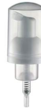
LI 313-4 Ø30/400