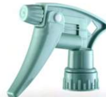
LI 107-F Ø28/400, Ø28/410, Ø28/415