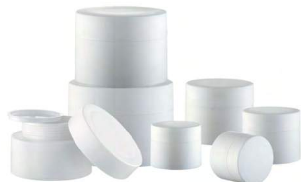
LI 503-3 3ML, 5ML, 10ML, 15ML, 30ML, 50ML, 80ML FULL PP JAR