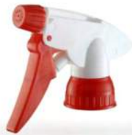
LI 107-C Ø28/400, Ø28/410