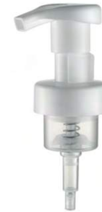
LI 313-8 Ø40/400, Ø43/400