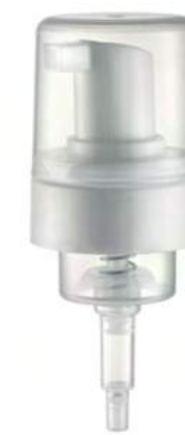
LI 313-7 Ø43/400