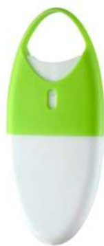
LI 610-4 16ml