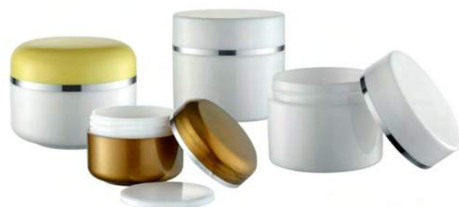
LI 503-1 20ML, 30ML, 50ML FULL PP JAR