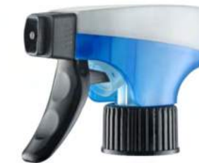
LI 105-4 oil