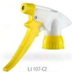
LI 107-C2 Ø28/400, Ø28/410