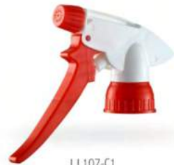
LI 107-C1 Ø28/400, Ø28/410