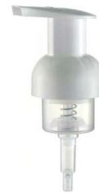
LI 313-6 Ø40/400

Discharge Rate: 0.80-0.90ml/T Specification: Ø40/400, Ø43/400