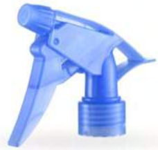
LI 107-A Ø28/400, Ø28/410

Specification: Ø28/400, Ø28/410, Ø28/415