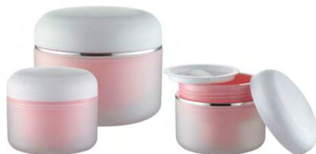
LI 503-2 30ML, 50ML, 100ML, 150ML FULL PP JAR