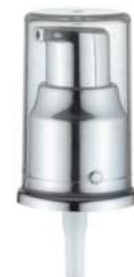
LI 604-6 Ø20/410