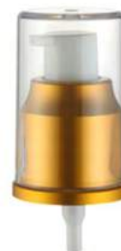
LI 604-6 Ø24/410