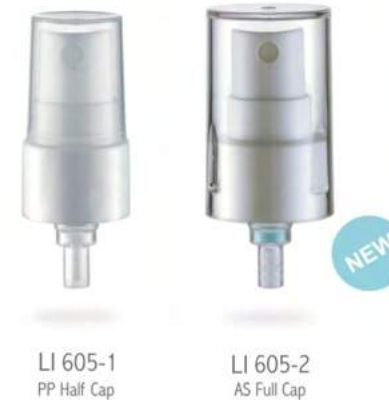
LI 605-1 PP Half Cap

LI 605 Discharge Rate: 0.20-0.25ml/T Specification: Ø18/410, Ø20/410, Ø24/410