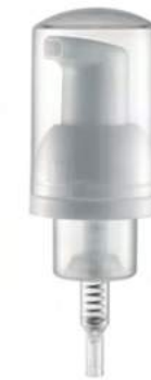
LI 313-3 Ø28/400