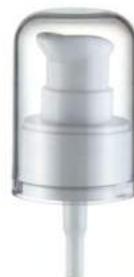
LI 604-5 FULL AS CAP