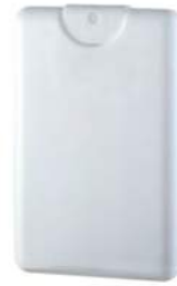
LI 610-1 25ml