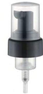
LI 313-5 Ø32/400