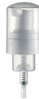
LI 313-2 Ø28/400