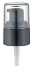
LI 604-4 HALF AS CAP