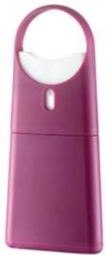
LI 610-4 20ml