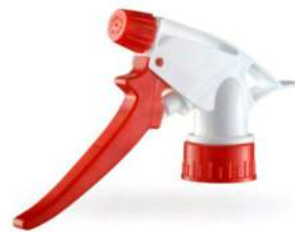
LI 107-A1 Ø28/400, Ø28/410