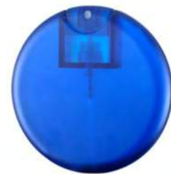
LI 610-7 25ml