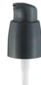
LI 604-7 Ø20/410