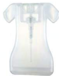
LI 610-5 16ml