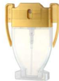
LI 610-6 30ml