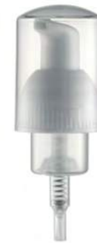
LI 313-1 Ø28/400

Discharge Rate: 0.25-0.30ml/T Specification: Ø28/400, Ø30/400, Ø32/400