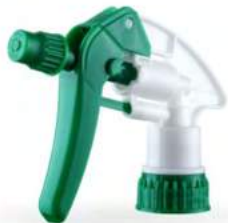
LI 107-D1 Ø28/400, Ø28/410